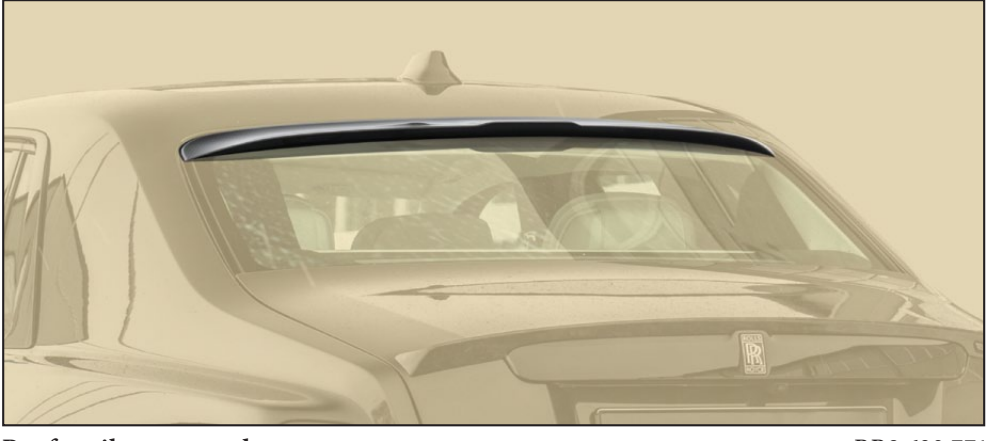
Roof spoiler - exposed visible carbon fibre primed without clear coat