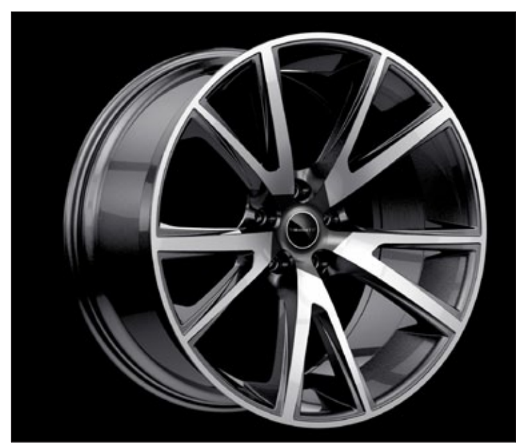
Y.5 wheel 23 inch Diamond black Black Matte 10,5 x 23 - ET 45 with wheel cap