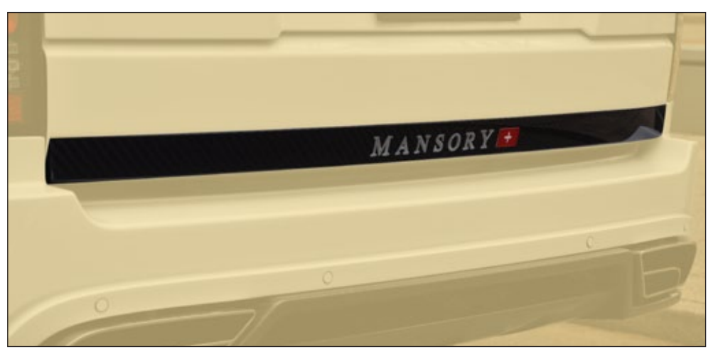
Rear hatch panel visible carbon fibre without clear coat