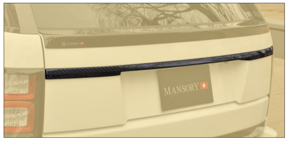
Rear panel visible carbon fibre without clear coat