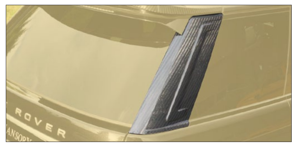
D-pillar cover 2 parts set - left & right - visible carbon fibre glossy*