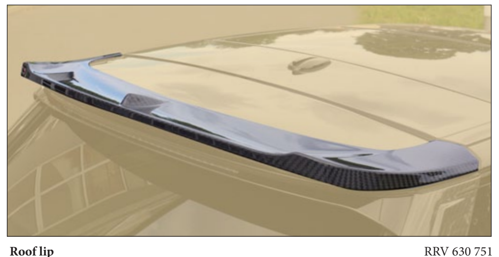
Roof lip visible carbon fibre without clear coat