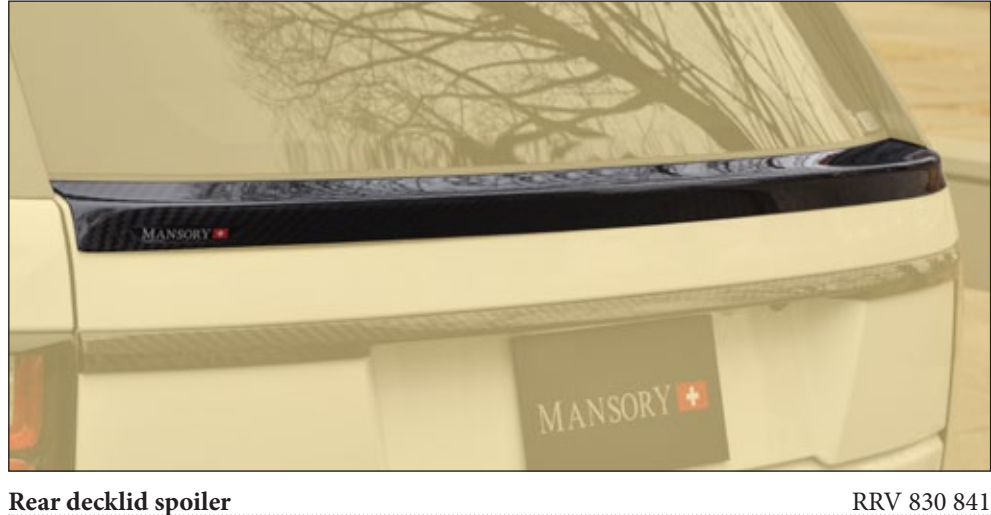
Rear decklid spoiler visible carbon fibre without clear coat