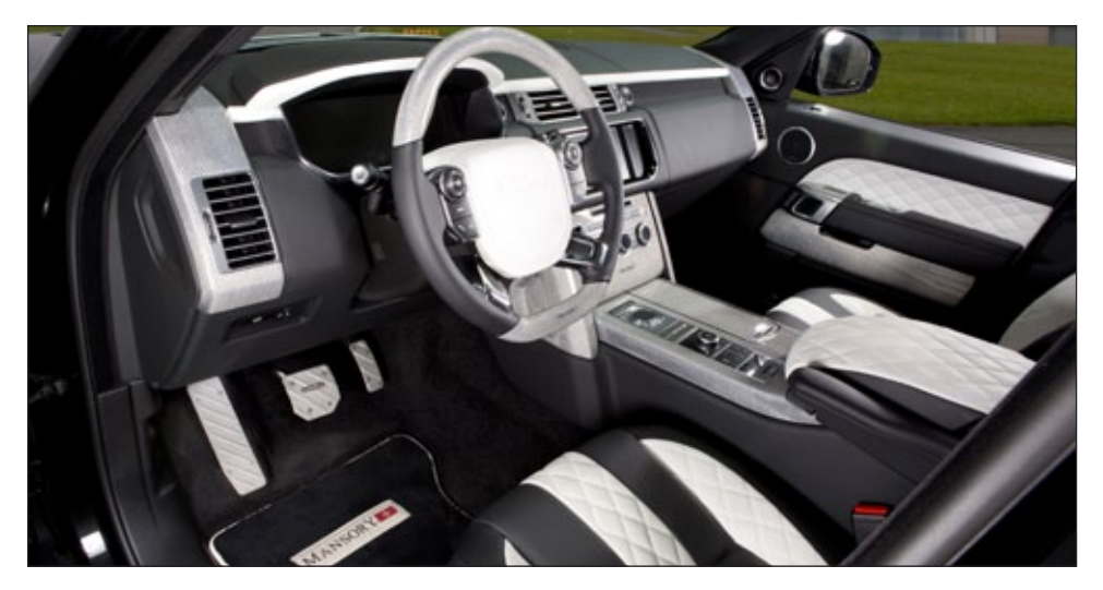
MANSORY Individualized Interior Kit Complete refined interior, by exclusive leather sorts, combination on customers request.

Air ventilation frames RRV 350 011 4 parts set, available with carbon and wood O modification only, OE-part required