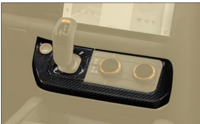
Carbon middle console surround part ..... LRD 390 101 2 parts set