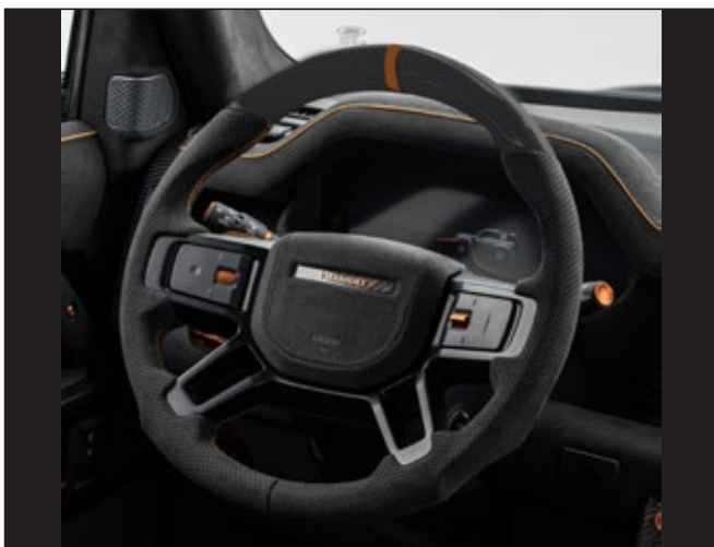
Sport steering wheel with MANSORY logo leather/carbon ..... LRD 351 541