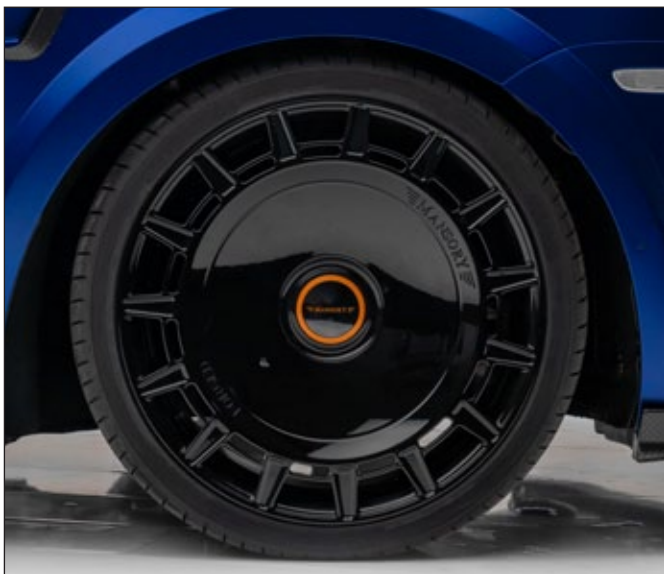
FD.15 - 24" fully forged wheel ..... FD15 24 10 36 120 BG BLACK GLOSSY 1pcs., 10x24, ET36,

with equipped by permanently logo position wheel cap