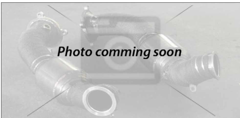
Down pipe with EUR6 with Cat 200 Cell LRD 221 119