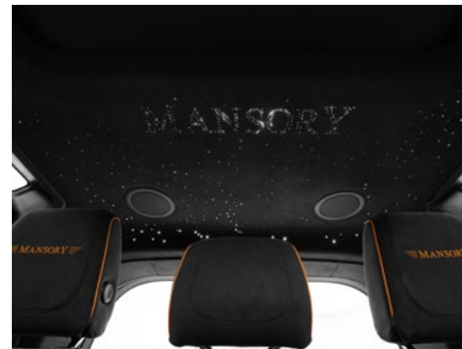
Headliner ..... LRD 390 000 🔄 modification only, OE-part required