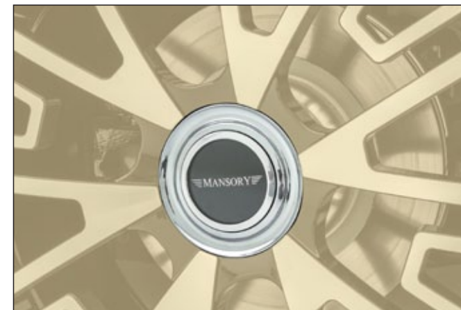
Wheel cap - Chrome ..... MWC 100 001 Wheel cap - Black glossy ..... MWC 100 002 Equipped by permanently logo position

✂ Recommended tyre size 295/40 22 Continental 295/35 23 Continental