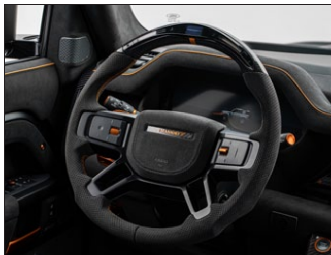
Sport steering wheel with display with MANSORY logo leather/carbon ..... LRD 351 551