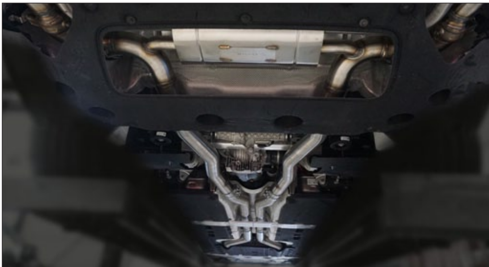
Sport Exhaust Muffler with down pipe for MANSORY Rear diffuser LRD 222 219 with alluminium double exhaust blinds, Exhaust remote control with CAT 200 cell, End muffler ⓘ Only for export! ✘ Compatible only with MANSORY Rear diffuser