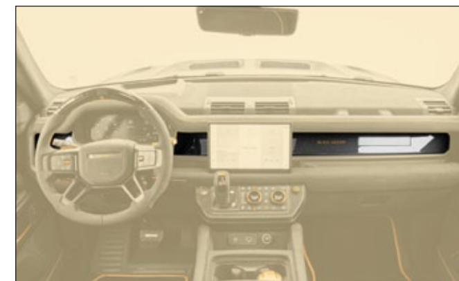
Carbon dashboard panel illuminated logo ..... LRD 390 108 2 parts set with illuminated MANSORY Logo Carbon dashboard panel logo ..... LRD 390 109 2 parts set with MANSORY Logo