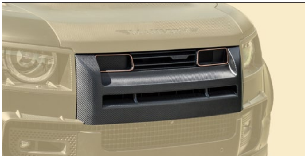
Front grill mask with illuminated logo