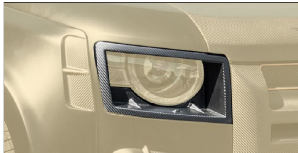
Head light carbon cover

visible carbon fibre primed without clear coat