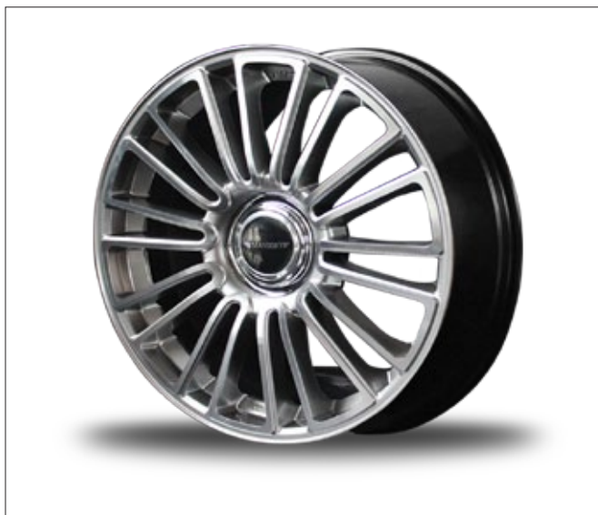
CS.10 wheel 22 inch ..... CS10 22 10 40 120 S ( Silver diamond cut ) 1pc., 10 x 22" OS 40,