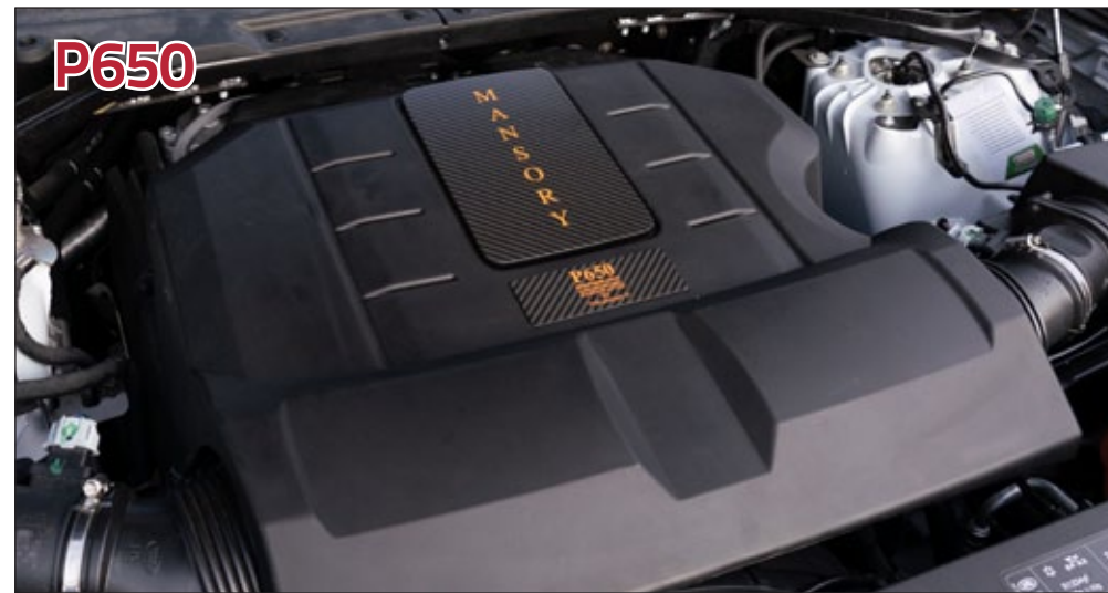
P650 Performance LRD 650 223 Supercharger New Pulley ✘ Compatible only with P525 V8 Supercharged DEFENDER