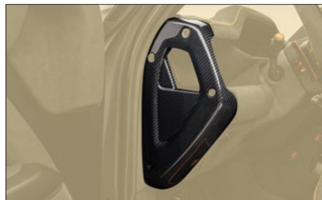
Carbon dashboard side cover ..... LRD 390 105 2 parts set