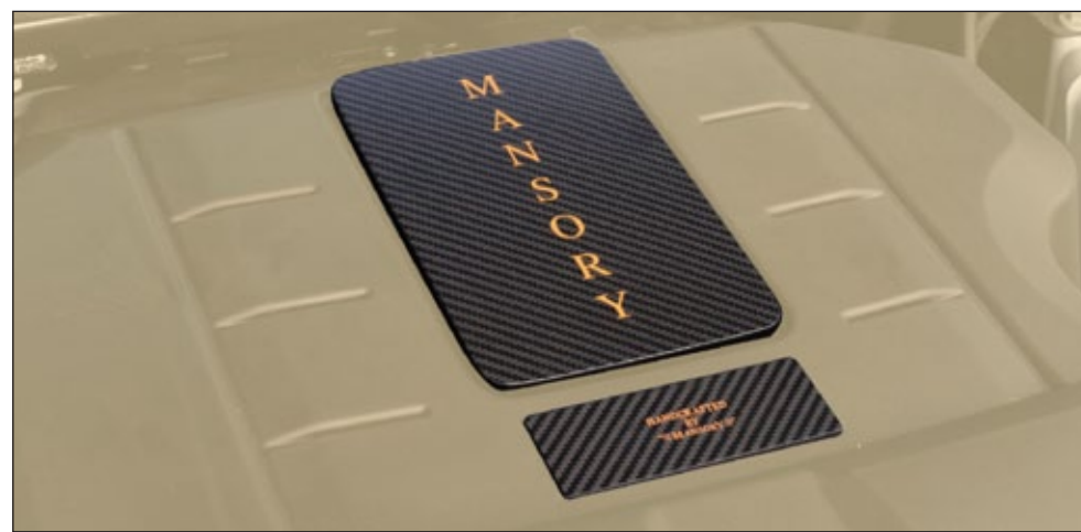
Engine cover LRD 240 741 with MANSORY logo