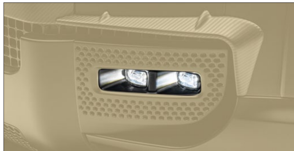
Double light for front bumper

visible carbon fibre primed without clear coat