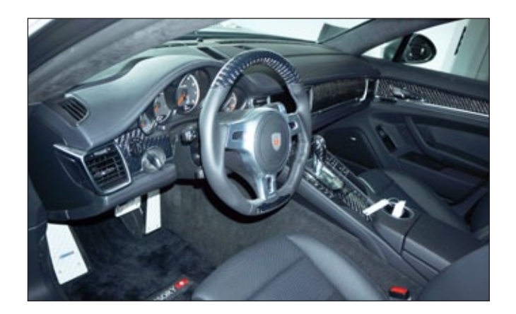
MANSORY Individualized Interior Kit

Complete refined interior, by exclusive leather sorts, combination on customers request.