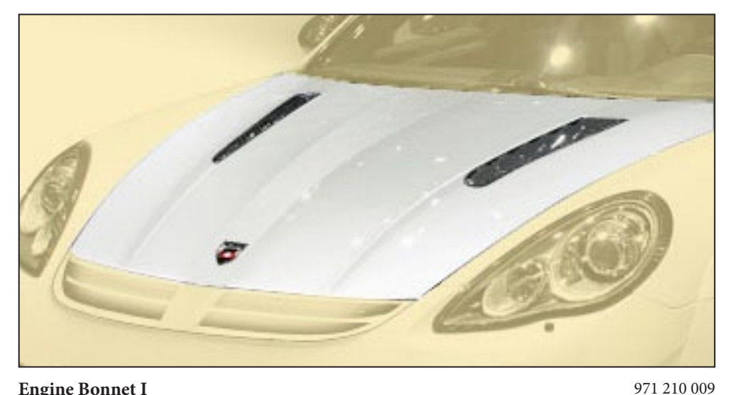
Engine Bonnet I not visible carbon fibre primed air outtake visible carbon fibre without clear coat