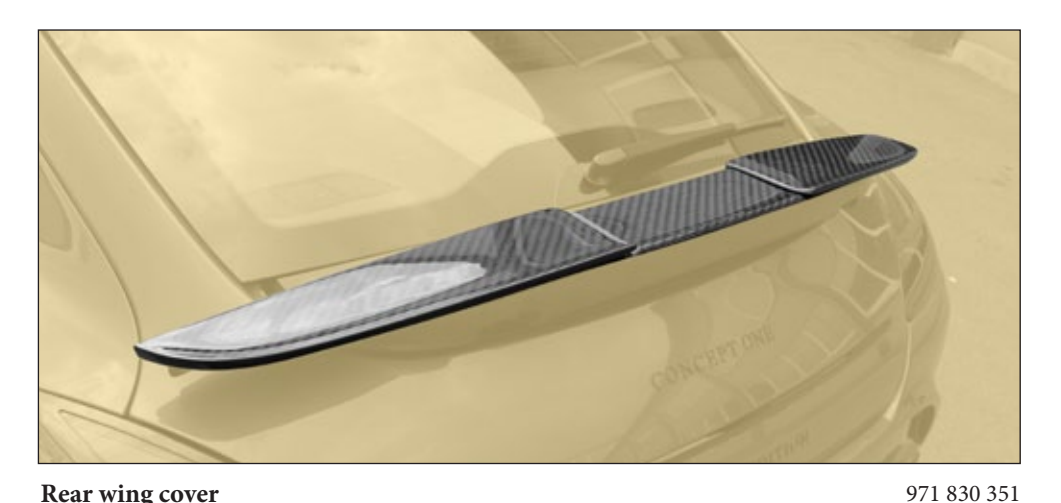
Rear wing cover Refinement of serial rear spoiler - covers for original ( left, right, middle ) visible carbon fibre without clear coat