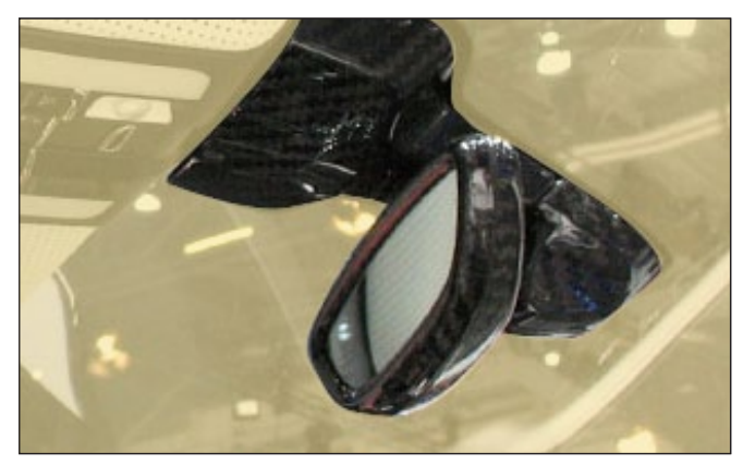
Rear Mirror Housing carbon fibre