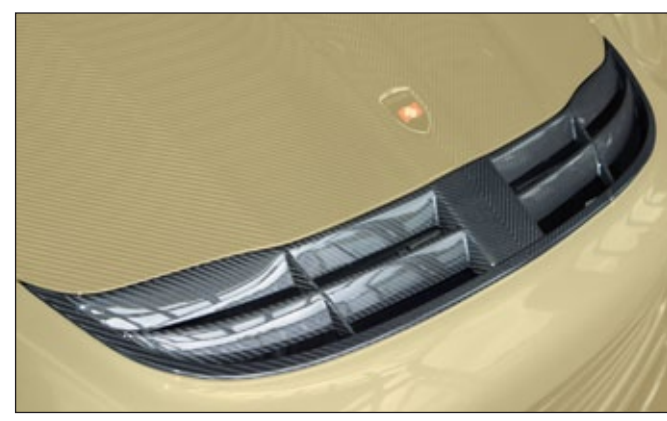
Air intake engine bonnet