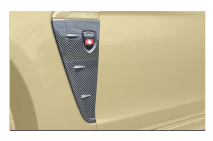
Fender wing sheet