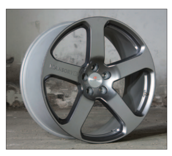
C.5 - 5 spoke wheel with chrome / silver wheel cap