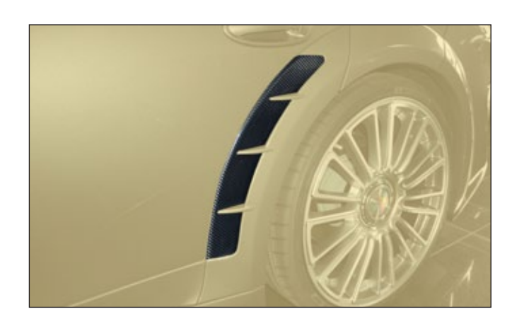
Carbon cover for rear fender

2 parts set - left & right, visible carbon fibre without clear coat