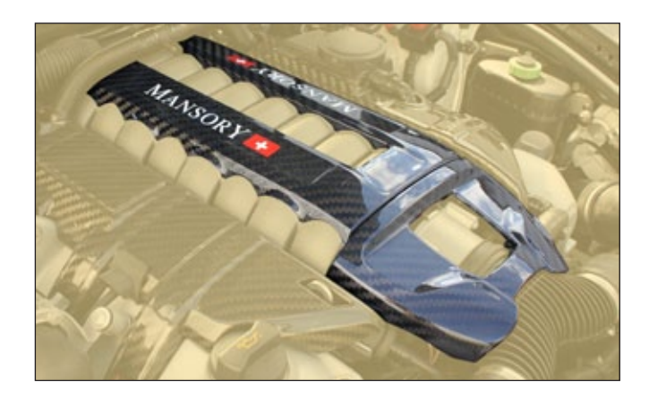
Engine cover exposed with MANSORY Switzerland