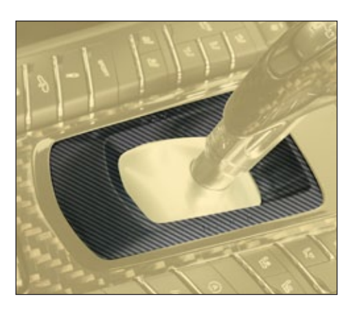
Frame - gearshift