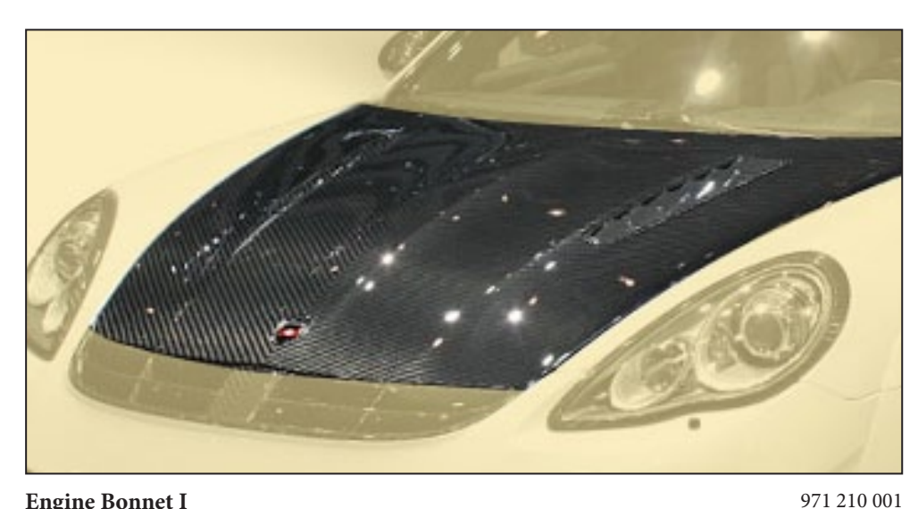
Engine Bonnet I visible carbon fibre without clear coat