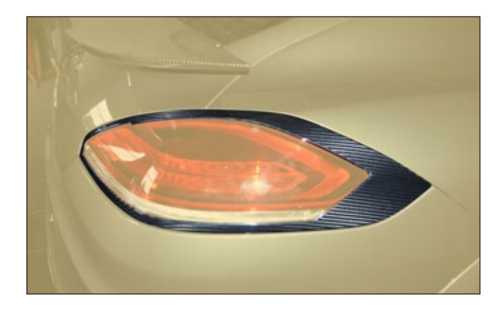
Rear light cover

2 parts set - left & right, visible carbon fibre without clear coat