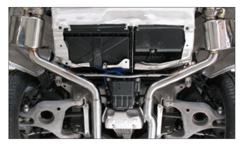
Sport Exhaust with Throttle System for serial rear bumper

with MANSORY Switzerland logo visible carbon fibre without clear coat