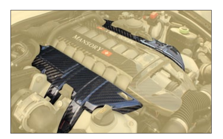
Engine flank covers exposed

Sport Muffler with Throttle left & right Remote Control, Extension Tail Pipes and assembling parts.