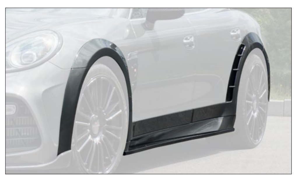
Door & Fender extension kit + side skirts

daytime running lights, front lip visible carbon fibre without clear coat, air intake grills, air intate engine bonnet