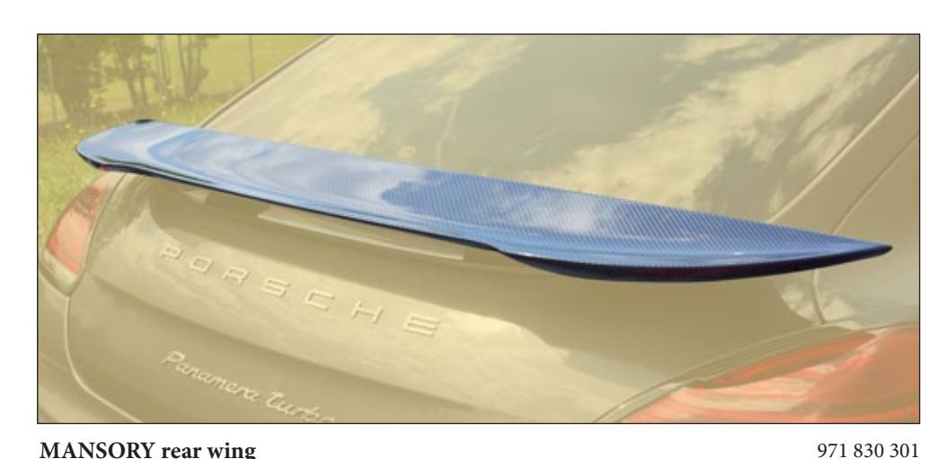
MANSORY rear wing Aerodynamic designed rear spoiler, visible carbon fibre without clear coat