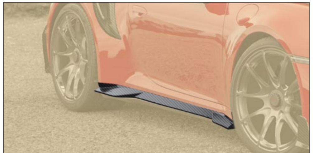
Side skirts lips

visible carbon fibre primed without clear coat