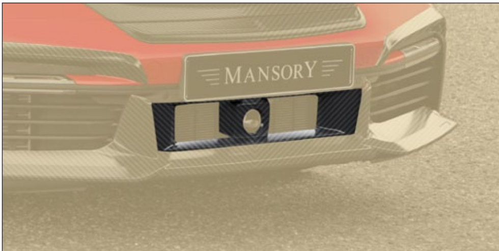
Front central air intake

2 parts set - left & right, visible carbon fibre primed without clear coat