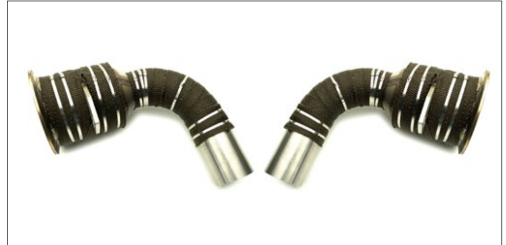
Down pipe with EUR6 with Cat 200 Cell