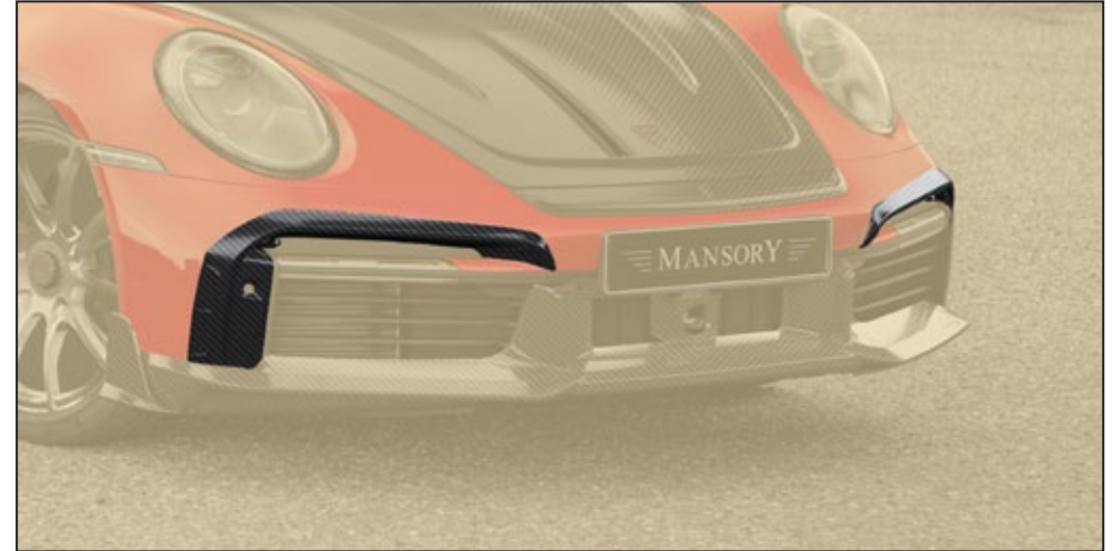
Front bumper covers add-on

visible carbon fibre primed without clear coat with logo