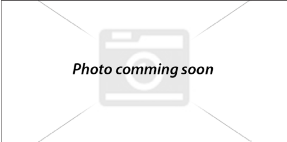
Down pipe without Cat