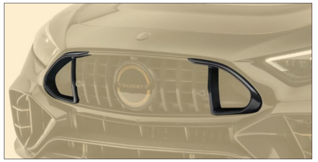
Air intake for front mask visible carbon fibre without clear coat

Front splitter with LED DRL visible carbon fibre primed without clear coat 2 parts set - left & right