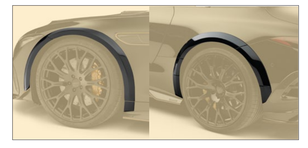
Fenders extension 12 parts set - left & right

(i) assumtion of reflectors from original rear bumper