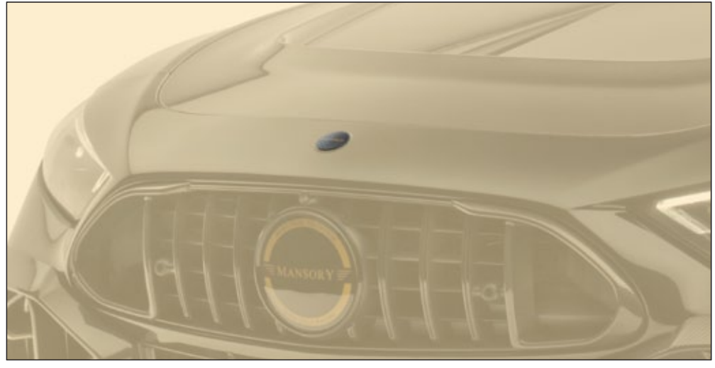
Front bumper emblem with logo visible carbon fibre glossy*