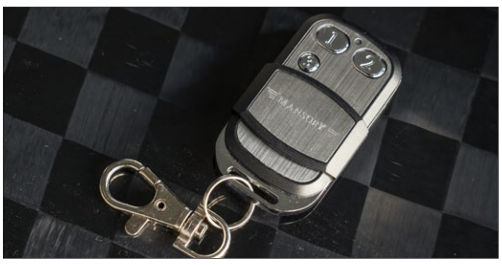
Exhaust remote control PLUG & PLAY compatible also with OEM Exhaust