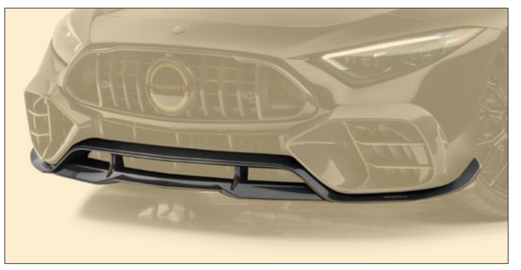
Front lip with middle splitters visible carbon fibre primed without clear coat