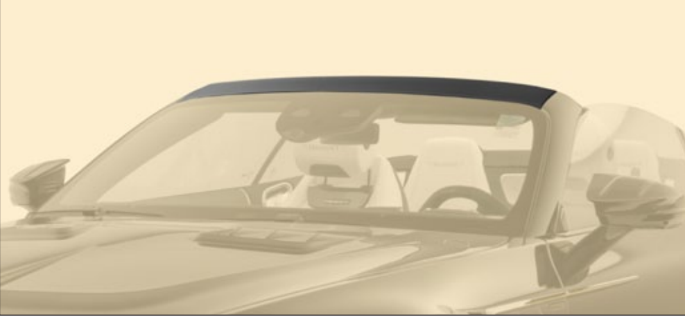
A pillar roof panel - visible carbon visible carbon fibre primed without clear coat