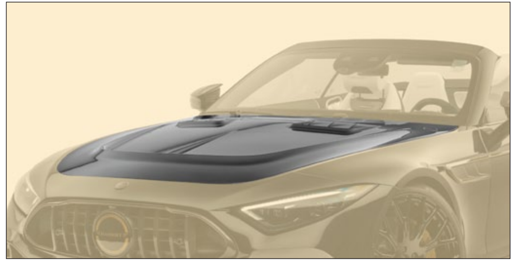
Front bonnet - visible carbon visible carbon fibre primed without clear coat