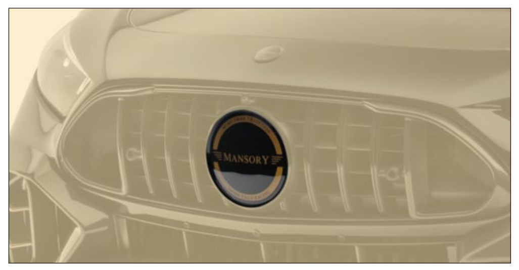
Front grill mask emblem with MANSORY Branding