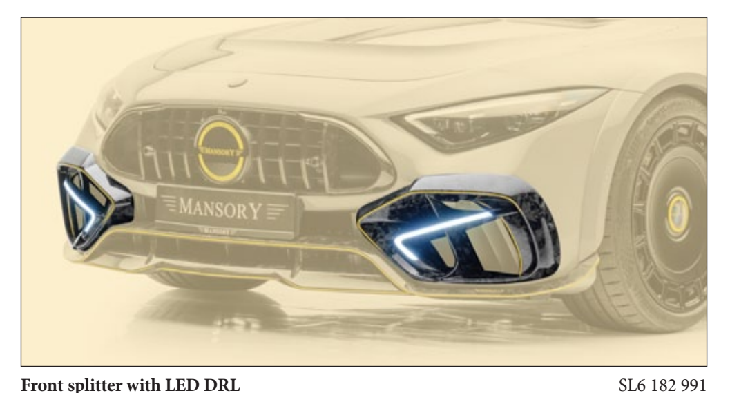
Front splitter visible carbon fibre primed without clear coat 2 parts set - left & right