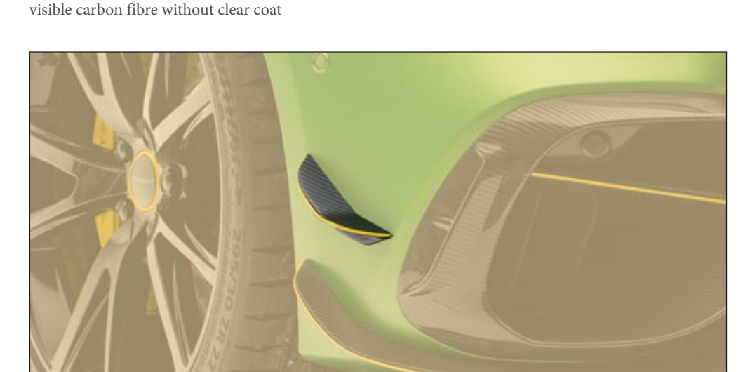
Carbon flaps visible carbon fibre primed without clear coat 2 parts set - left & right