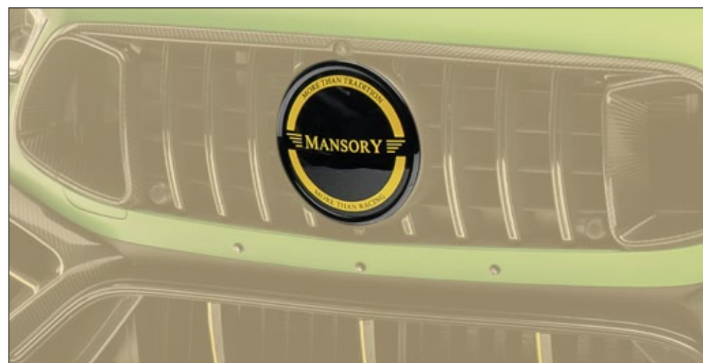
Front grill mask emblem with MANSORY Branding