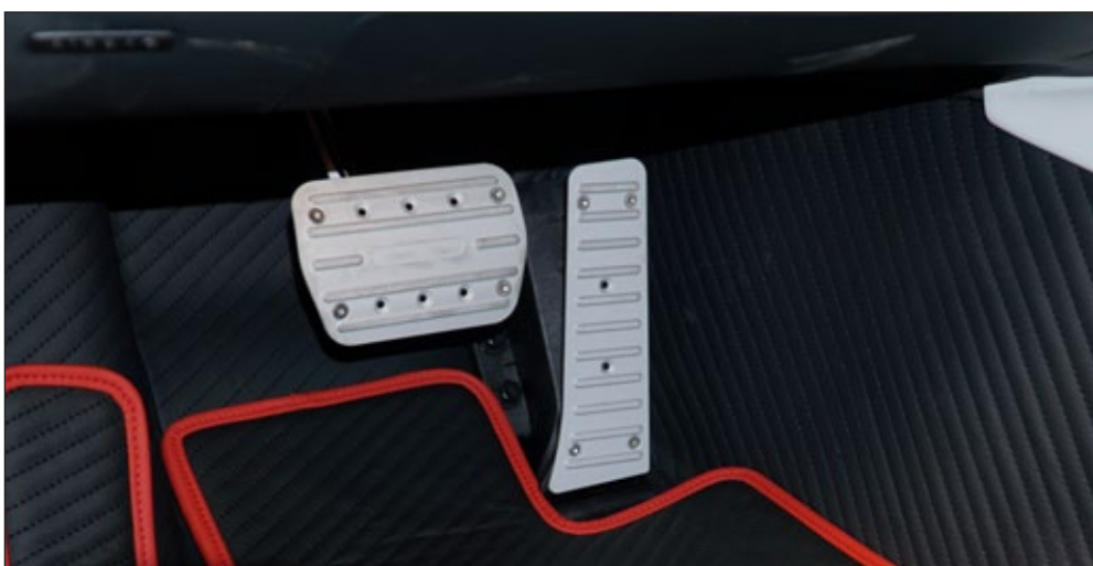
Sport pedals ..... GT4S 367 127