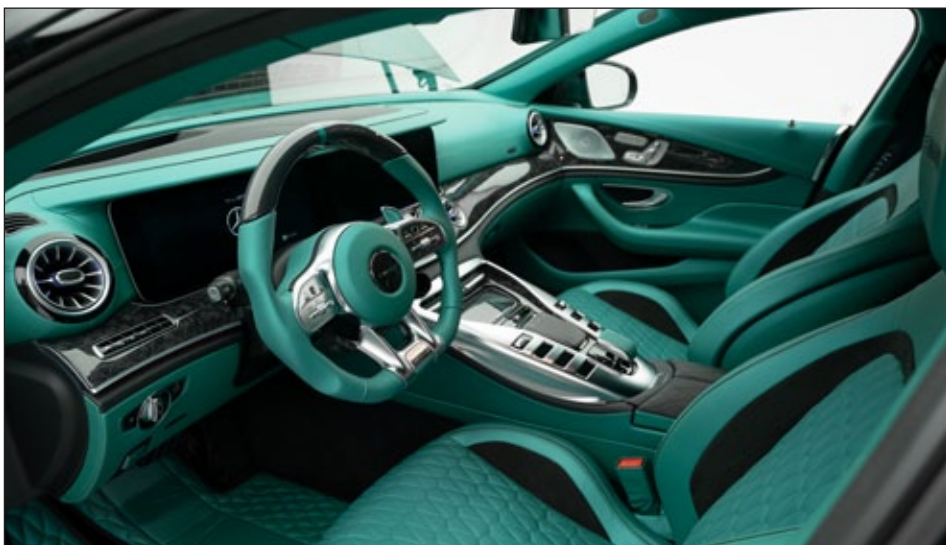
MANSORY individual interior kit ..... GT4S 300 000

Complete refined interior, by exclusive leather sorts, combination on customers request.