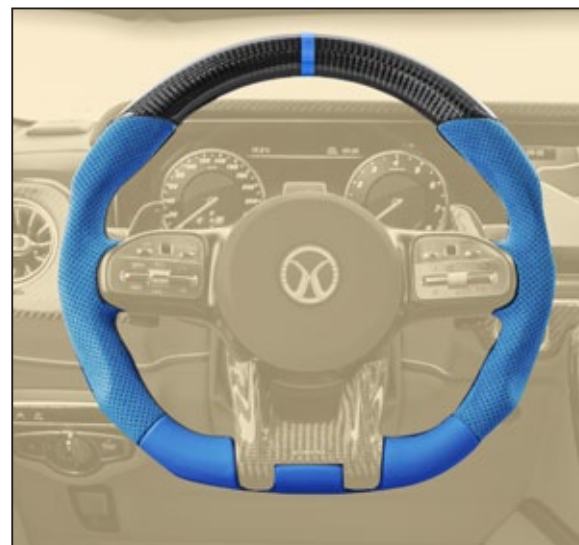
Sport steering wheel with logo MANSORY

Complete refined interior, by exclusive leather sorts, combination on customers request.