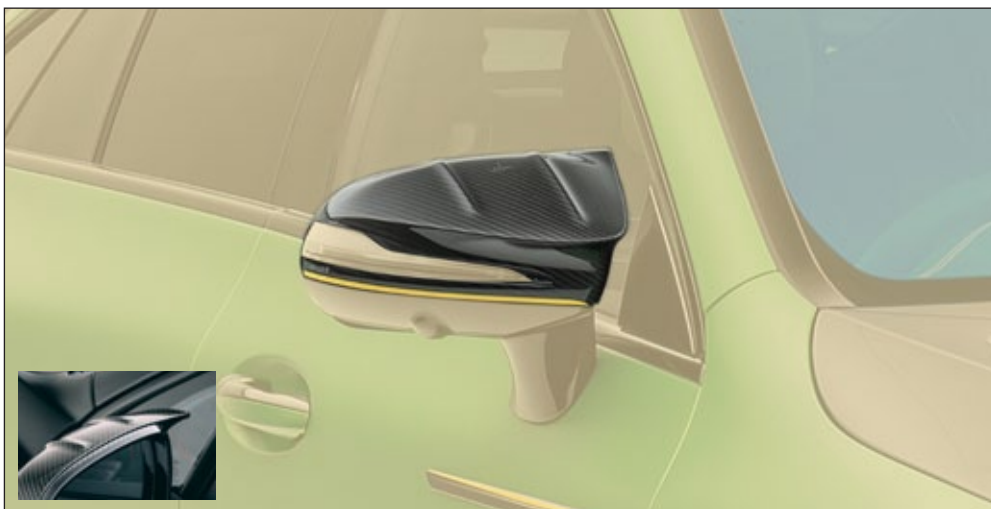
Carbon mirror housing II.