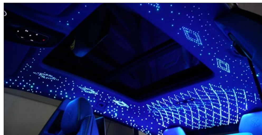
Exclusive headliner with starlights ..... GT4S 656 301