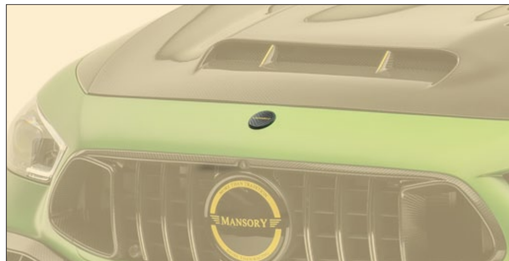
Front bumper emblem with logo