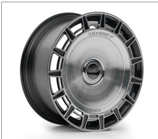
FD.15 21" / 22" fully forged wheel

FA: 295/30 22 Continental SC7 / RA: 335/25 22 Continental SC7