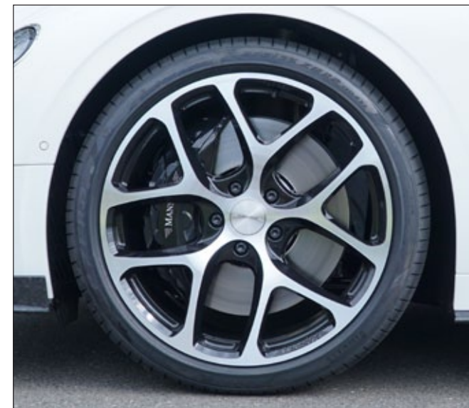
BY5 - fully forged wheel wheel 22 inch - Diamond black

FA: 295/30 22 Continental SC7 / RA: 335/25 22 Continental SC7