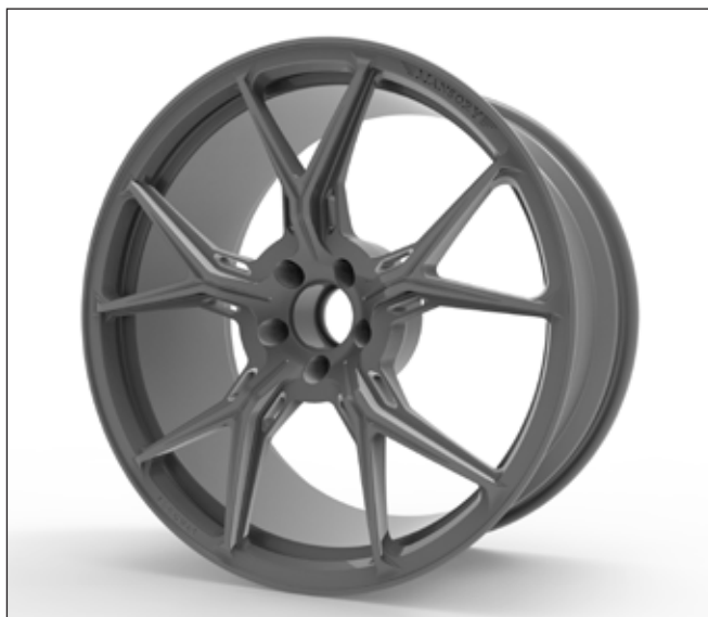
FY.5 21" / 22" fully forged wheel