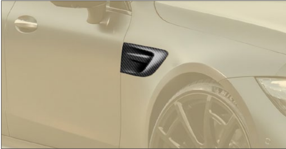
Front fender emblem with MANSORY logo