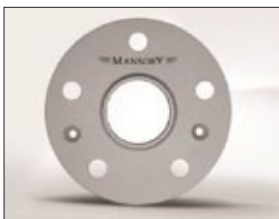
Spacer adapter kit for 23 inch wheel