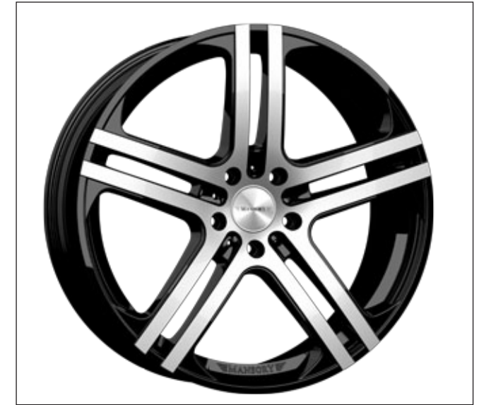
N.50 Wheels 23 inch

✂ recommended tyre size - 295/35 23 Continental SC6 ⓘ Spacer adapters kit must be ordered separately