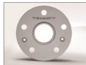
Spacer adapter kit for 23 inch wheel

✂ recommended tyre size - 295/35 23 Continental SC6 ⓘ Spacer adapters kit must be ordered separately