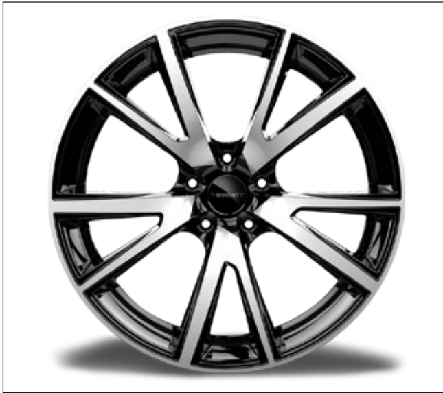
Y.5 wheel 23 inch