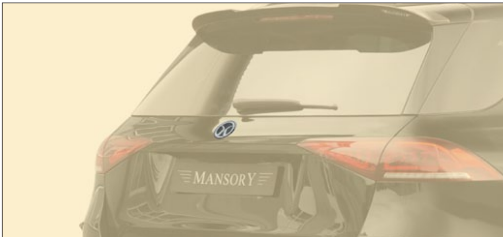
Rear hatch emblem