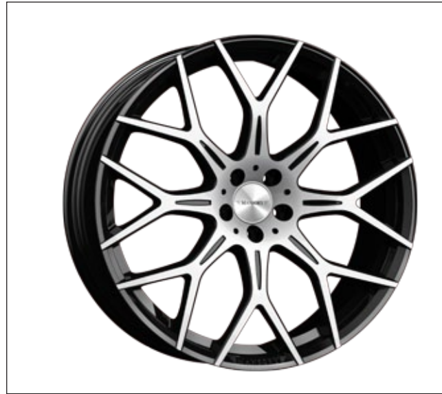
N.80 Wheels 23inch