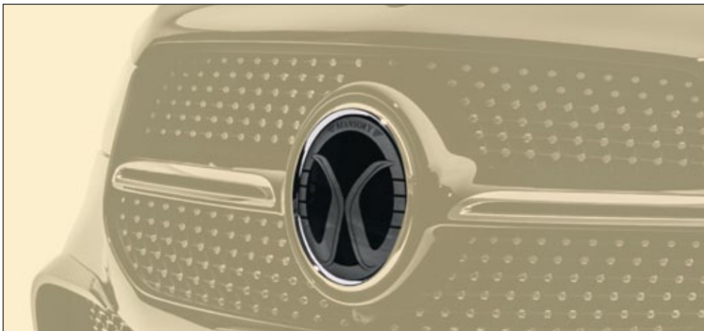
MANSORY logo for grill mask