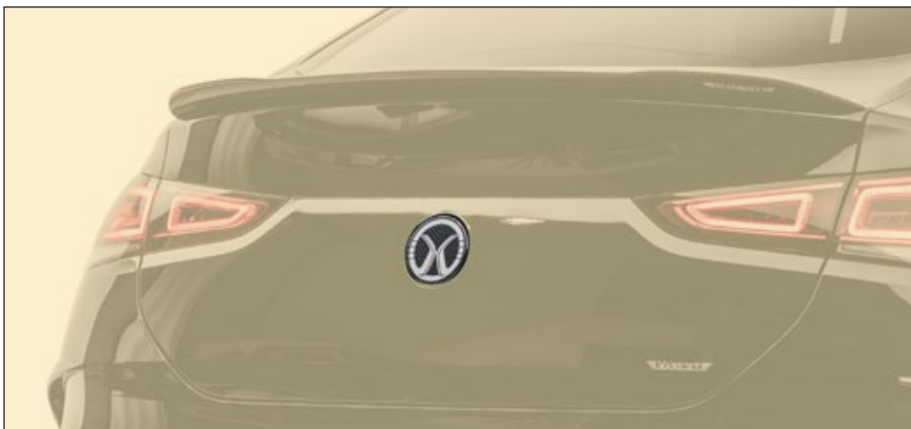
Rear hatch emblem