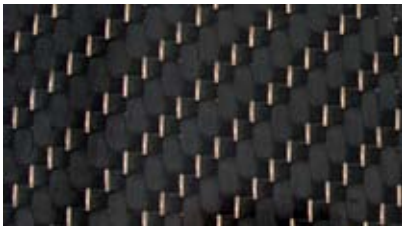
PATTERN WITH COPPER INLAY