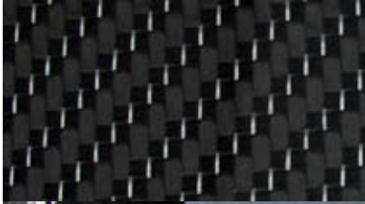
PATTERN WITH SILVER INLAY