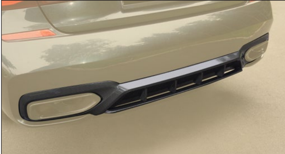
Rear diffuser with diffuser board ..... 717 802 991 visible carbon fibre glossy*

ⓘ compatible only with M Sportpaket / M Performance