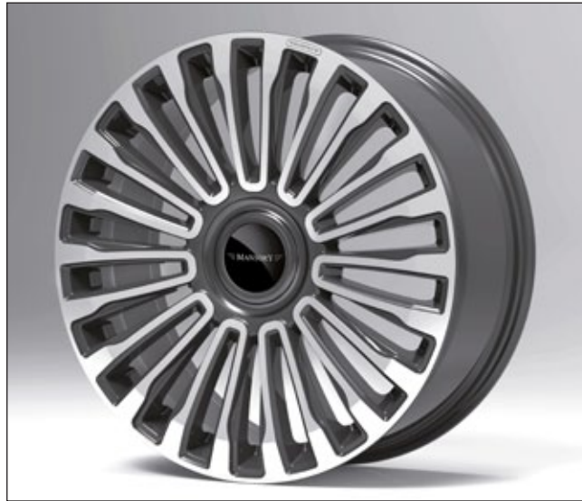
CS.11 21 inch ( Diamond anthracite ) front: 9x21 ET30 (5/112-5/130) CS11 21 9 30 1230 A rear: 10,5x21 ET42 (5/112-5/130) CS11 21 105 42 1230 A

✂ Recommended Tires 21 inch - FA: 255/35/21, RA:295/30/21 22 inch - FA: 255/30/22, RA:295/25/22