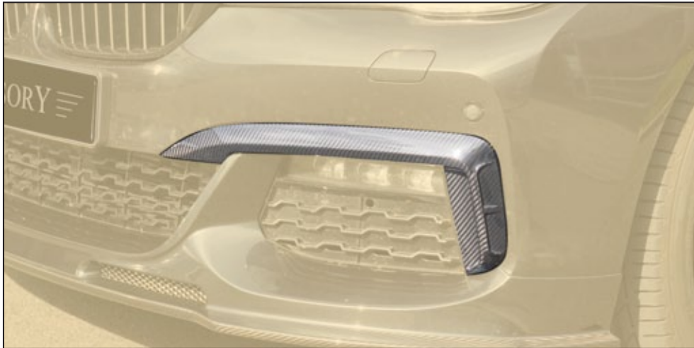
Front splitter - carbon 717 102 891