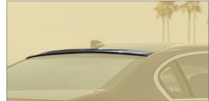
Roof spoiler - carbon ..... 717 630 751 visible carbon fibre glossy*