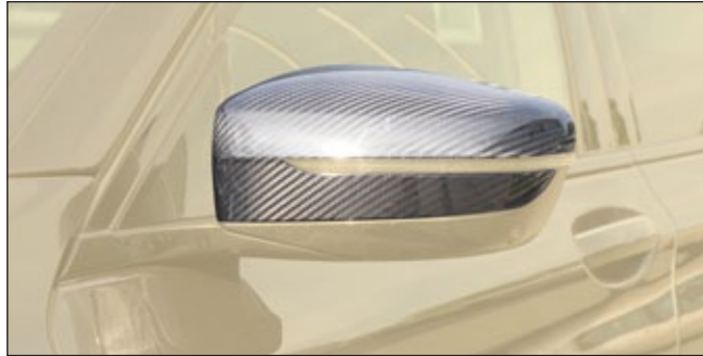
Carbon mirror cover ..... 717 522 201 with MANSORY logo