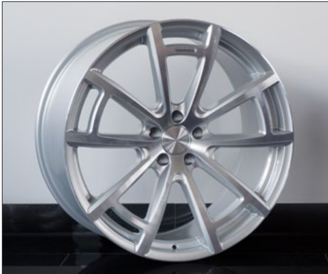
CS.5 21 inch ( Diamond silver ) front: 9,5x21 ET35 (5/112) CS5 21 95 35 112 S rear: 10,5x21 ET35 (5/112) CS5 21 105 35 112 S