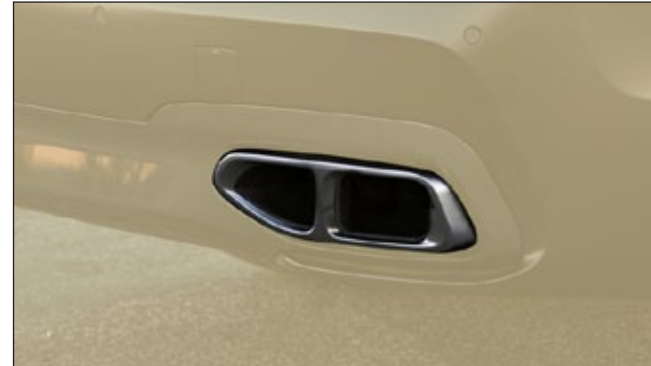
Exhaust tip Black Chrome left (Original part 51128069687- no discount) ..... 717 805 8BL right (Original part 51128069688- no discount) ..... 717 805 8BR