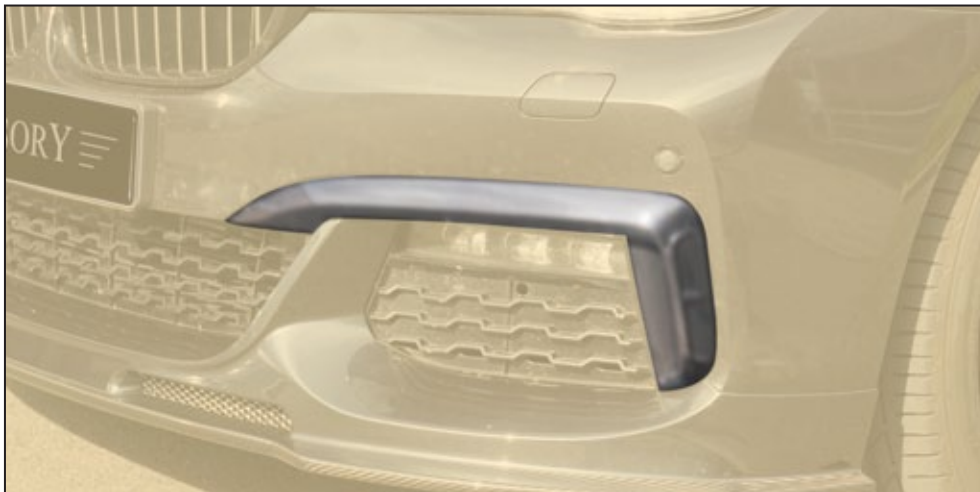
Front splitter - primed 717 102 895