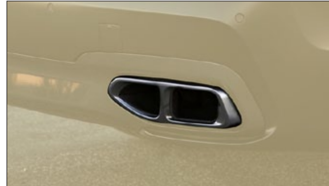
Exhaust tip Black Chrome

ⓘ compatible only with M Sportpaket / M Performance