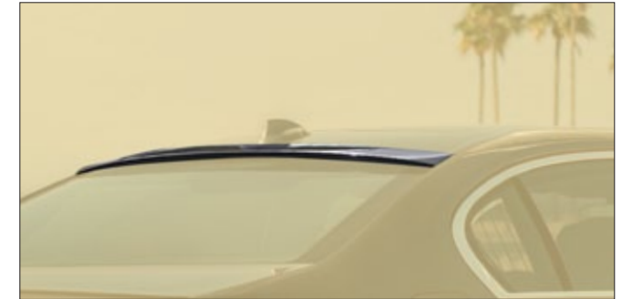
Roof spoiler - carbon ..... 717 630 751 visible carbon fibre glossy*