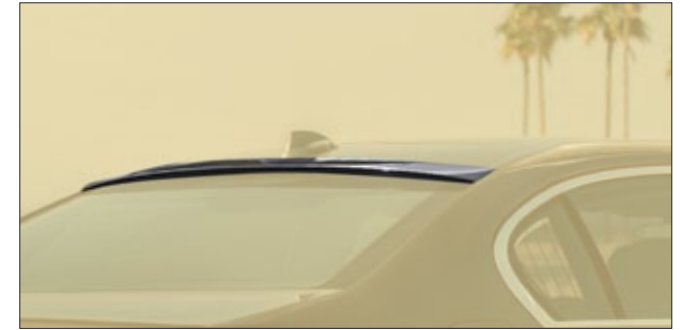
Roof spoiler - carbon ..... 717 630 751 visible carbon fibre glossy* Roof spoiler - primed ..... 717 630 755 primed not visible carbon fibre