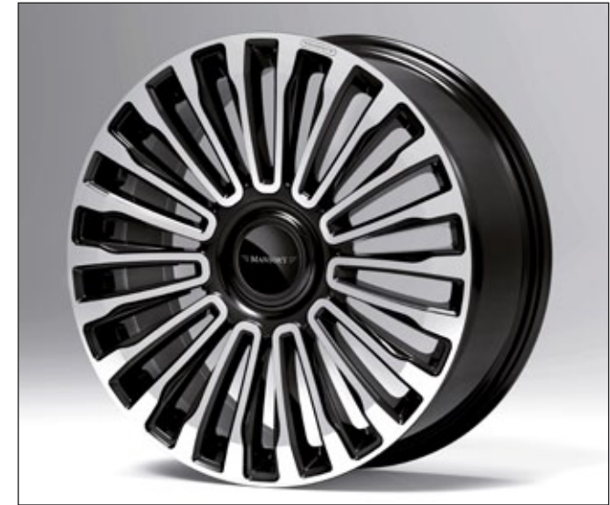
CS.11 21 inch ( Diamond black ) front: 9x21 ET30 (5/112-5/130) CS11 21 9 30 1230 B rear: 10,5x21 ET42 (5/112-5/130) CS11 21 105 42 1230 B

✂ Recommended Tires 21 inch - FA: 255/35/21, RA:295/30/21 22 inch - FA: 255/30/22, RA:295/25/22