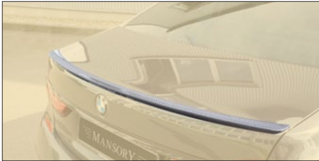
Rear decklid spoiler - carbon ..... 717 830 841 visible carbon fibre glossy*