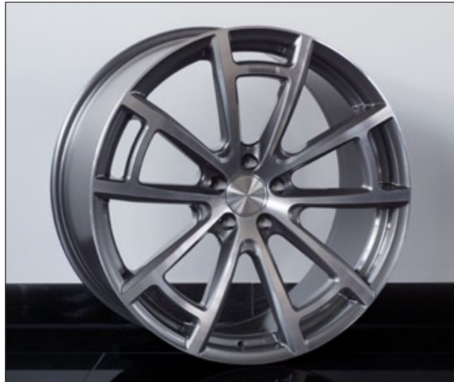
CS.5 21 inch ( Diamond anthracite ) front: 9,5x21 ET35 (5/112) CS5 21 95 35 112 A rear: 10,5x21 ET35 (5/112) CS5 21 105 35 112 A