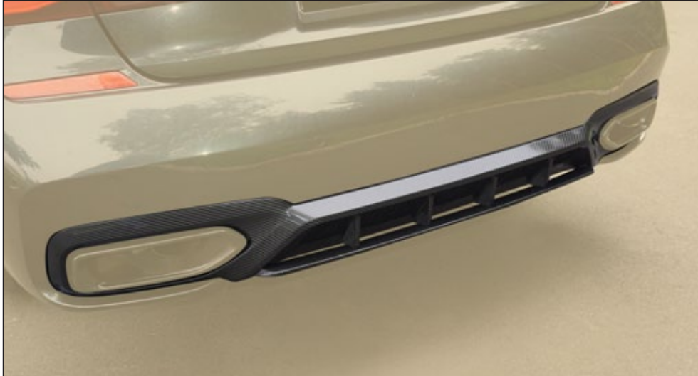
Rear diffuser with diffuser board ..... 717 802 991 visible carbon fibre glossy* ⓘ compatible only with M Sportpaket / M Performance