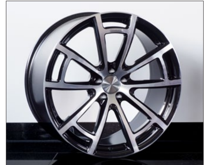
CS.5 21 inch ( Diamond black ) front: 9,5x21 ET35 (5/112) CS5 21 95 35 112 B rear: 10,5x21 ET35 (5/112) CS5 21 105 35 112 B

✂ Recommended Tires 21 inch - FA: 255/35/21, RA:295/30/21 22 inch - FA: 265/30/22, RA:295/25/22