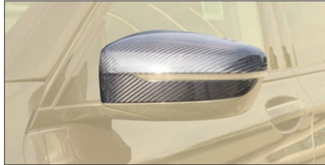
Carbon mirror cover ..... 717 522 201 with MANSORY logo 2 parts set - left & right, visible carbon fibre glossy*