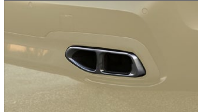
Exhaust tip Black Chrome left (Original part 51128069687- no discount) ..... 717 805 8BL right (Original part 51128069688- no discount) ..... 717 805 8BR

ⓘ compatible only with M Sportpaket / M Performance